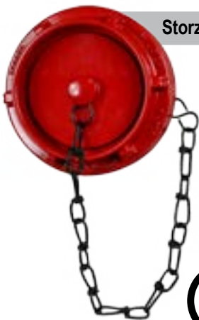
Storz X NPT Rig F W/ Cap 4" & 5" Straight Storz FDC

MATERIAL: Forged Aluminum T6160, Nitrile Gasket FINISHES: STANDARD: Powder coat (17 standard colors) OTHER CHOICES: Hard coat, K-Chrome and K-Brass